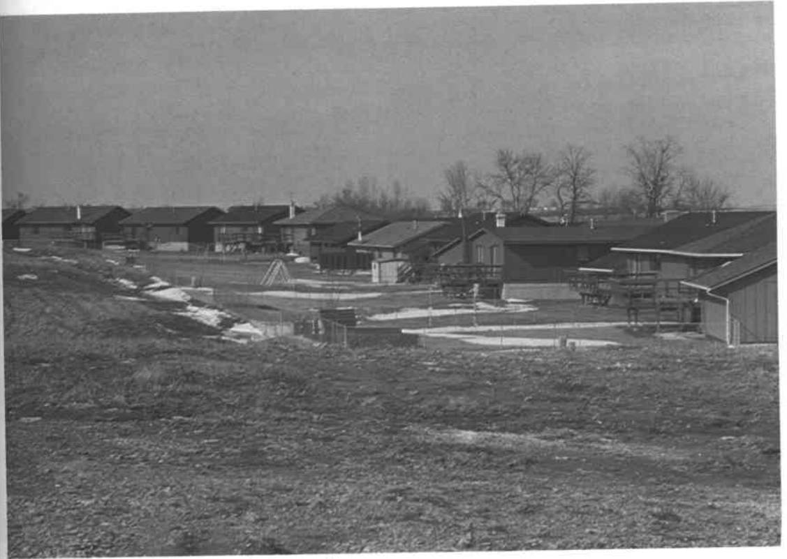
Backyard patios near Cedar Rapids.

tion into the housing industry as never before. Federal subsidies for housing further stimulated the building boom. The population explosion following World War II and a spiraling economic cycle gave added thrust to home construction. At the edge of cities, planned and unplanned communities sprang up without the homes or the influence of the once powerful and respected gentry class who in an earlier day had set the example of the most desirable homes and fixed the patterns of social relations.