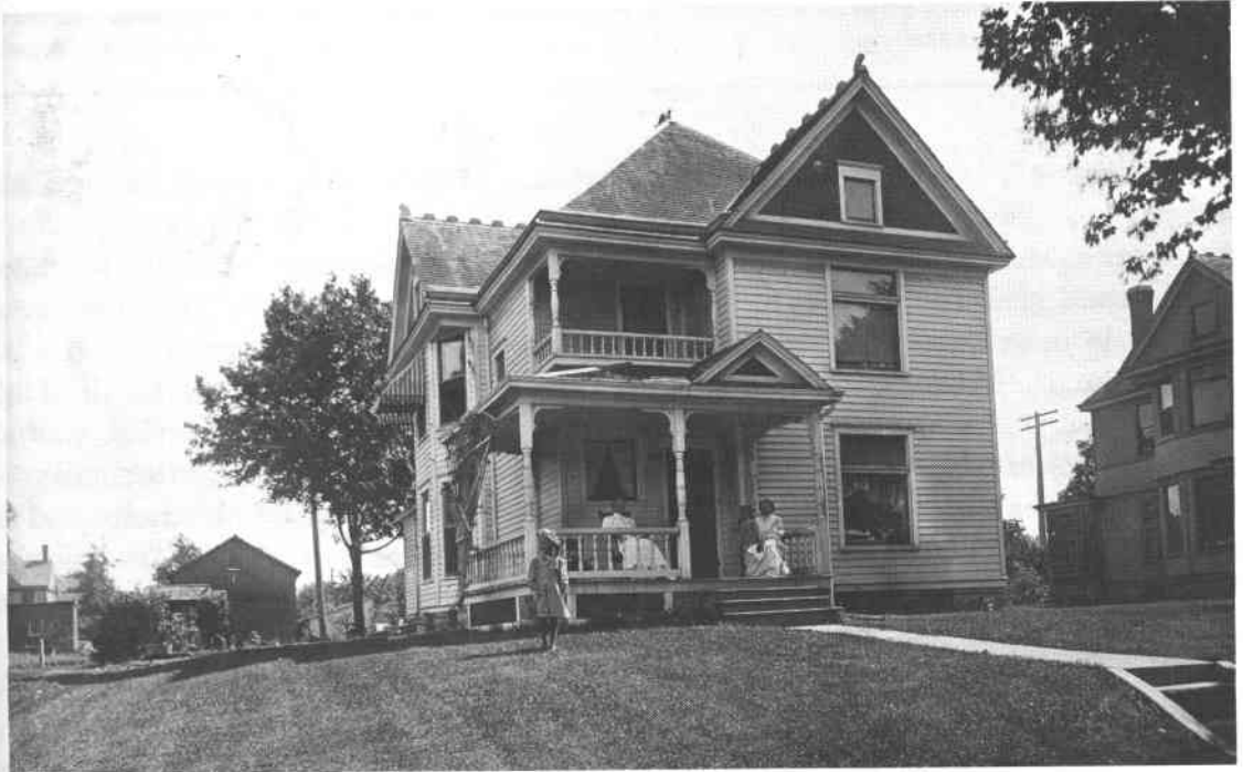
The women of the household relax on the porch of the Baptist parsonage in Vinton, Iowa. The spacious lawn and upper porch give an air of relaxed elegance to this example of the "porch" society.

in taste and social structure began to alter the form and the meaning of the porch. By the turn of the century a well established sash and door industry, new building materials, and innovative construction techniques granted home builders an even greater variety of porch styles from which to select. Labor was still cheaper than material. The gentry maintained their social and economic position, constructing homes much along the lines of the previous 30 years. Those with power and wealth seemed unafraid to let others know their status by constructing large and elaborate homes, but taste had begun to change. A few years before the dawn of the century Louis Sullivan, Frank Lloyd Wright, and others were searching for a new architecture which would