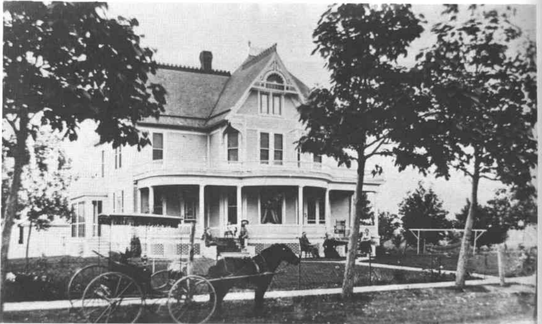
A marvelous porch, which extended across the entire front of the house, and which could accommodate the entire family, plus visitors. Note the low fence between sidewalk and yard.

or the citizen walking past the house saw the building for a long time and was well aware of the presence or absence of the residents on the porch.